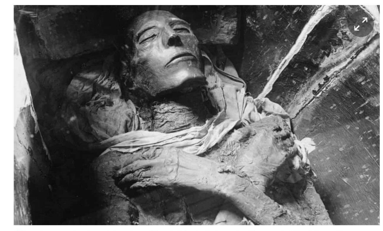
Egyptian mummies showed clear signs of fatty buildup in their arteries.

A study of the arteries of ancient Egyptians has challenged the received wisdom that the illness is simply down to unhealthy modern lifestyles